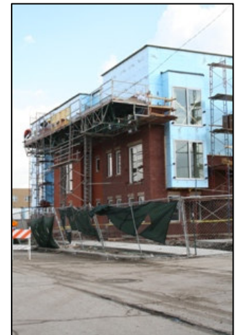
WestHaven Park on the Near West Side is one of several new mixed-income developments tied to the Chicago Housing Authority's Plan for Transformation.

Additional activities explore topics such as workforce development strategies for public-housing residents, financing mechanisms for mixed-income developments and tools for community building and engagement. ■