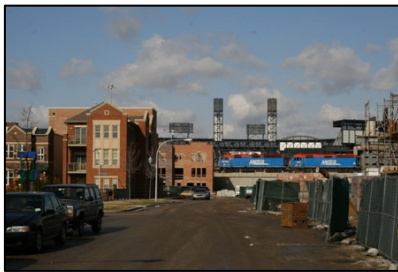
The Metra's Rock Island line heads south between U.S. Cellular Field and mixed-income development Park Boulevard. Beginning next fall, Metra's Rock Island line will stop near this point at 35 th St.

Scheduled to open by the fall of 2010, the nearly $12-million station is being funded in part by the American Recovery and Reinvestment Act, or federal stimulus package.