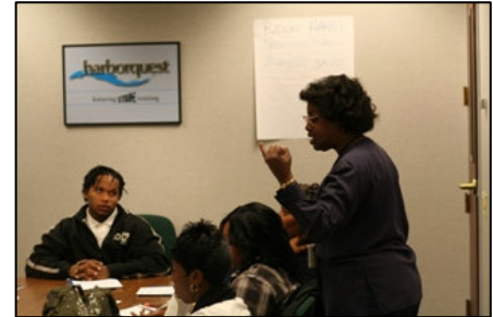
Photo: Harborquest clients attend a job training class.

The L 3 C legislation, signed into law by Illinois Governor Pat Quinn on August 4, and Harborquest recently were featured in a Chicago Tribune article, “New corporate structure could give social entrepreneurs new funding stream.” ■